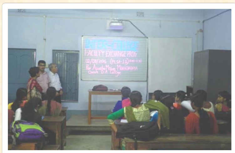
Inter-College Faculty Exchange Programme