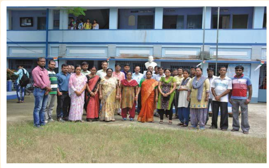
Teaching and Non-Teaching Staff