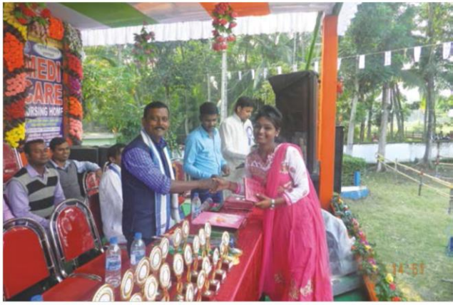
Annual Prize Distribution