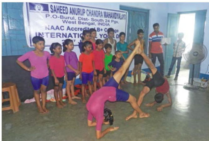
Celebrating International Yoga Day