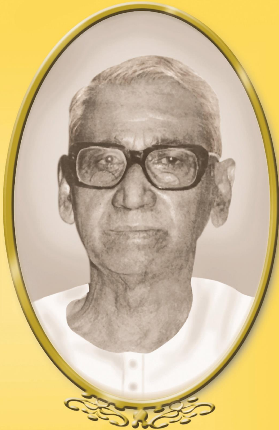
PRAVASH CHANDRA ROY (1907–1991)