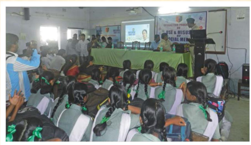
A Seminar on Safe Drive Save Life