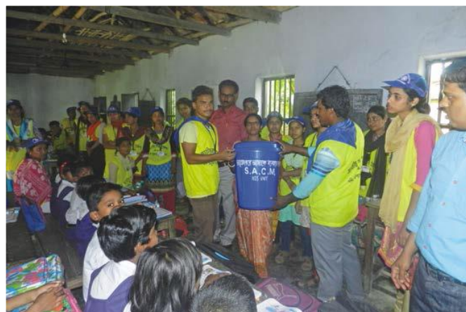
NSS Extension Programme