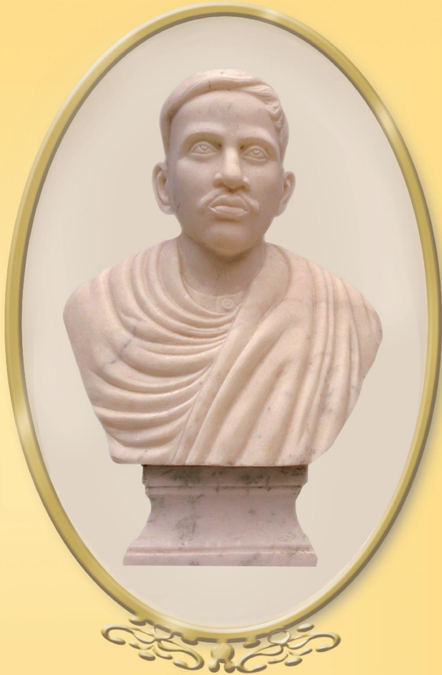
SAHEED ANURUP CHANDRA SEN (1899–1928)